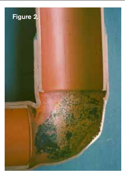
Figure 2 shows a cross-section of a brazed joint that only is partially filled; the unfilled crevice is a notch that intensifies the stress at the interface between the members and if there is any vibration, that notch will propagate and eventually result in a leak.

Unless you have X-ray vision, once a soldered or brazed joint is made, it's hard to tell how well the craftsperson filled the joint. If a joint is not properly heated, it might look good and have enough fill of the bonding area shown in Figure 1 to pass a hydrostatic test, but it could fail in service if the filler metal does not adequately fill the joint. This is especially true for soldered joints since solder, which is mostly tin, will creep – defined as a slow, permanent deformation of a solid material under the influence of mechanical stresses – at room temperature if the stress is high enough.