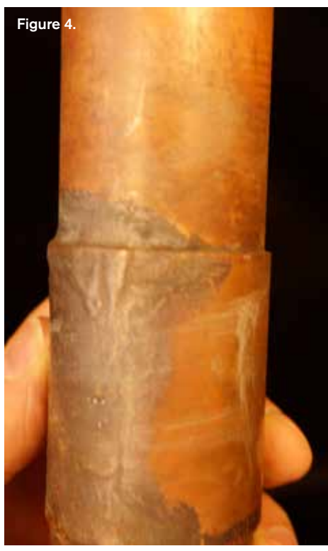
Figure 4 should be used. Separate samples are required for soldered and brazed joints since the acoustic properties of solder and braze metal are different.

The technician should be able to show the thickness of the fitting, the tube and, at the brazed or soldered joint, the sum of the fitting thickness plus the tube thickness. The technician can then scan joints and map out filled and unfilled zones as shown in Figure 5. I have successfully used this arrangement on sockets down to 1/2-in. tube size joints.